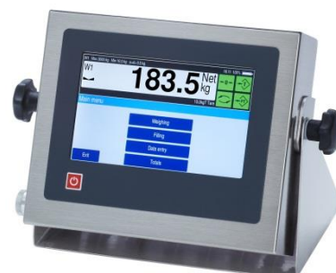
IT6000ET &amp; IT8000ET