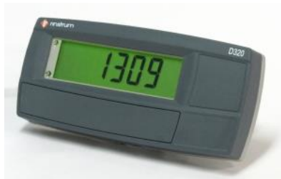
D320 REMOTE DISPLAY