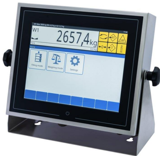
IT9 DESK / WALL MOUNT