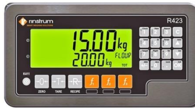
R423-A PANEL MOUNT