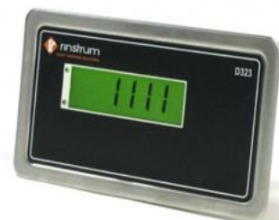
D323 REMOTE DISPLAY