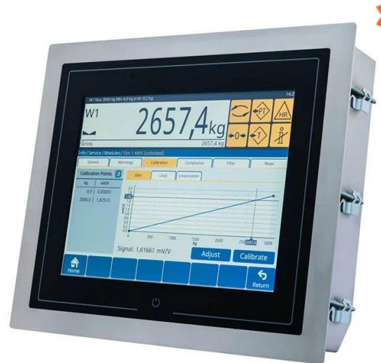
IT9 PANEL MOUNT