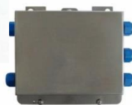
ATEX JUNCTION BOX